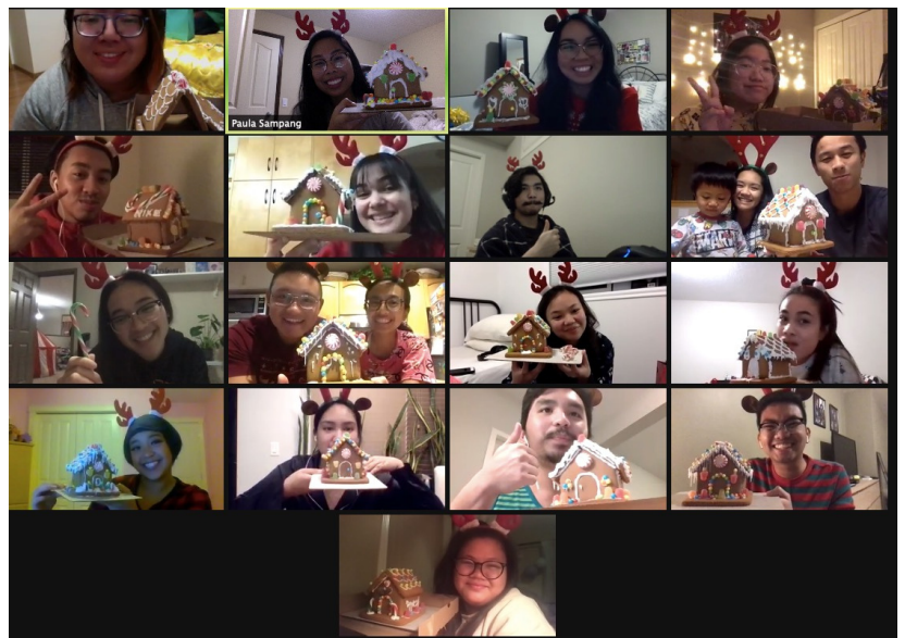
Room to Commune: Zoom Christmas Party (December 2020)

The young adults leadership is not looking to hold back because of COVID-19. We want to develop a place of community, transformation and encounter even online. In the future, we hope our young adults group can engage missionally with our local community. The young adults leadership desires to create a missional culture, where young adults feel confident to represent Jesus in their workplaces and schools.